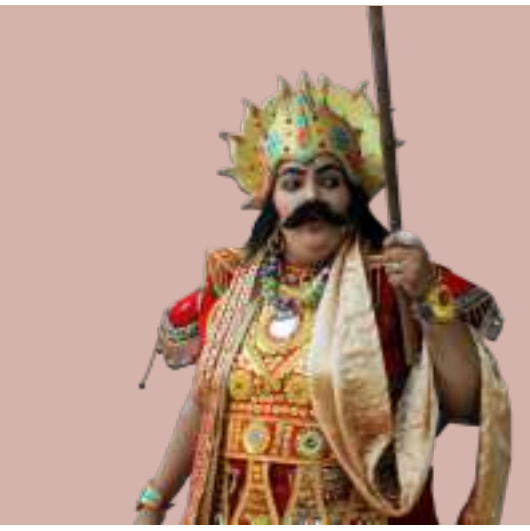
Haa...voo! Delicious of course, but who thought it would be so steaming hot!