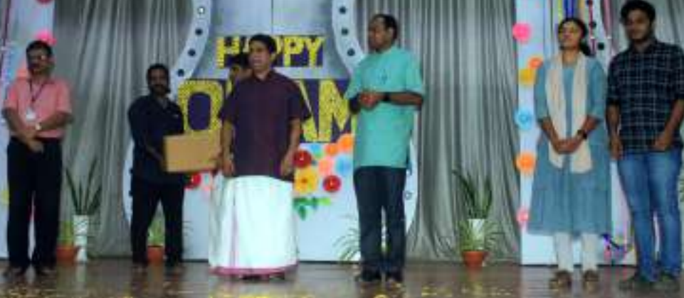
Onam gift of a different kind: Donating 1200 books to Project Aksharam of the District Administration