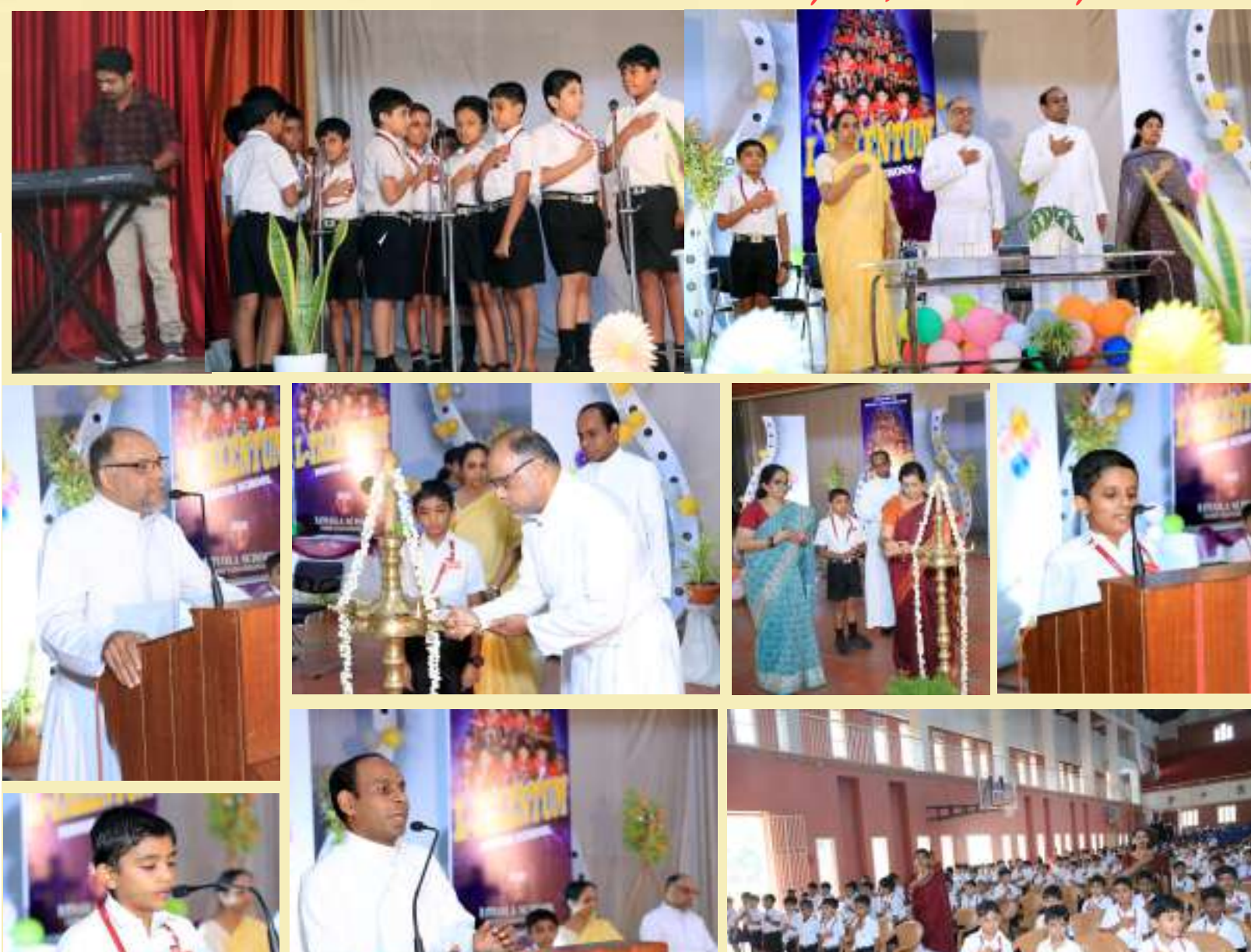
Inaugural Function: 9 August 2023