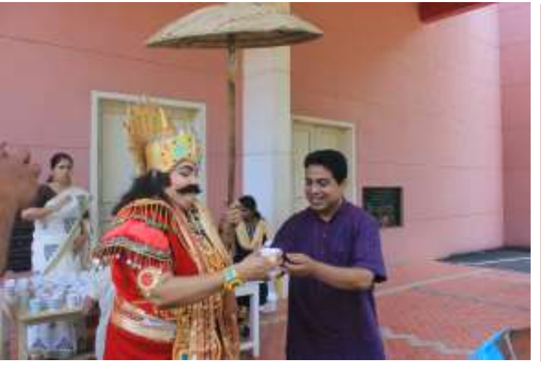
Inauguration of Payasam distribution, with the first cup to Maveli