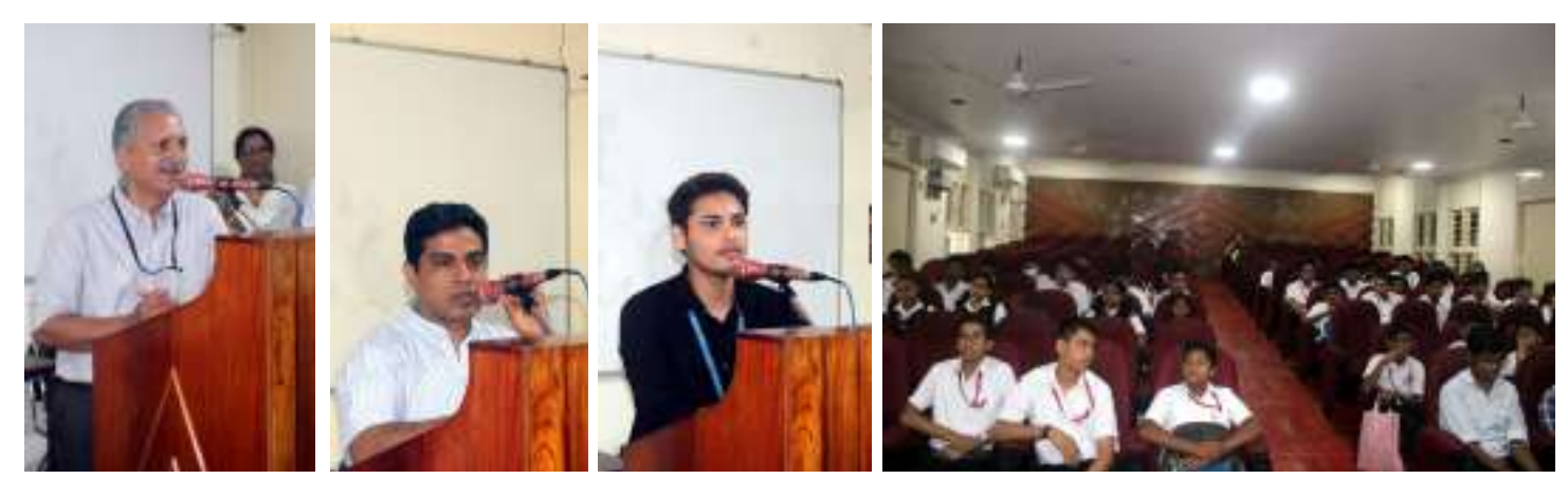
Formal Inauguration at the Multimedia Hall on 19 August

I had the great opportunity to participate in an interactive and engaging workshop on Artificial Intelligence and Machine Learning conducted by students from the Indian Institute of Space Science and Technology. The workshop, at our school on 19 August, was an eye-opener that introduced us to the fascinating world of A.I. and its diverse applications.